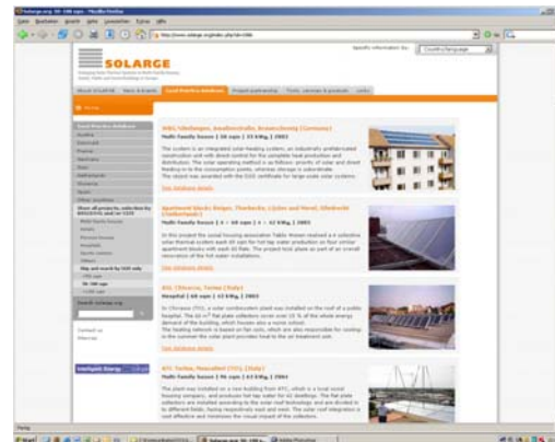
Slide example from the training materials