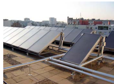
Large solar thermal plant in Paris

About 49 % of final energy demand in the EU is used for heating and cooling requirements, mainly in buildings. The buildings sector represents the major application field for solar thermal systems, which can contribute substantially to reducing greenhouse gas emissions and consumption of fossil fuels. Apart from Spain, large-scale (collective) solar thermal systems still represent a small or marginal market share throughout Europe, despite the fact, that they have been proven to be reliable and technologically mature. The main obstacles are not to be found in the technological area, but in the lack of knowledge capacity, need for activation of investors, installers, policy makers as well as necessity of intensified communication.