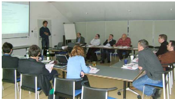
Training course in Germany