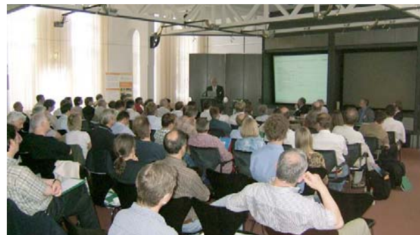
CSTS symposium in Hannover